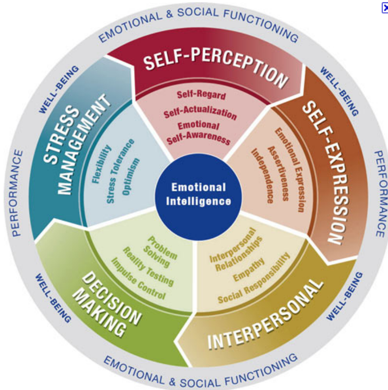
Copyright © 2011 Multi-Health Systems Inc. All rights reserved. Based on the original BarOn EQ-i authored by Reuven Bar-On, copyright 1997.

Emotional intelligence can be measured and the following chart shows the measurement for each item in the scale.